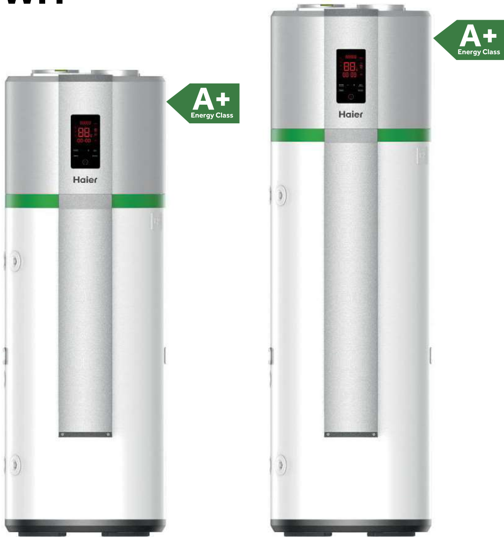
HP200M3 - HP250M3 - HP250M3C